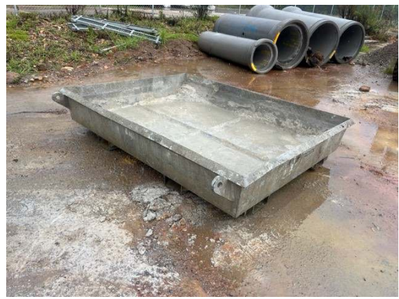
Photo 23-26: Pedestrian diversions, signage and concrete washout facilities around the site.