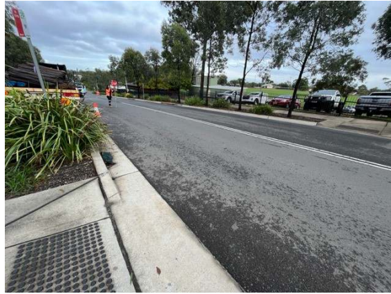
Photos 3-7: Surrounding streets were clean and ERSED controls were in place around stormwater inlets. There were no signs of tracking from the site or compound.