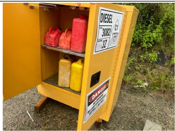
Photos 27 & 28: Diesel and jerry cans of fuel were stored in secondary containment and secure.