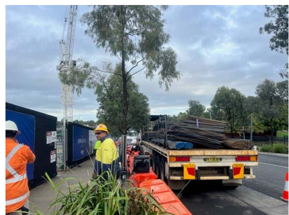
Photos 8-12: Pedestrian diversions were in place and safety barriers had been placed around footpaths. Traffic controllers were in place to guide pedestrians around the site. Approved work zones on Conferta Ave and Andalusian Drive were in use pedestrian diversions in place.