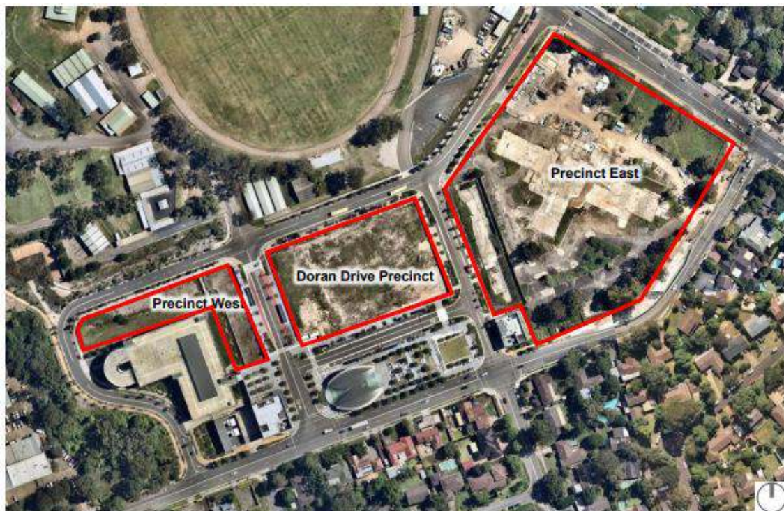
Figure 2: Doran Drive Precinct Site Location (centre) prior to development, Source: Nearmap 2022 / DPE Modification Assessment, 2022