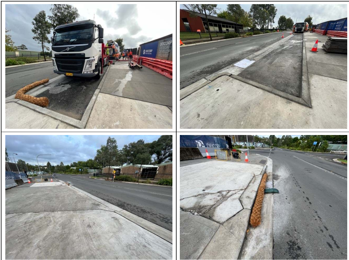
Photos 17-22: Controls were in place to reduce the risk of an environmental incident during concrete pours.