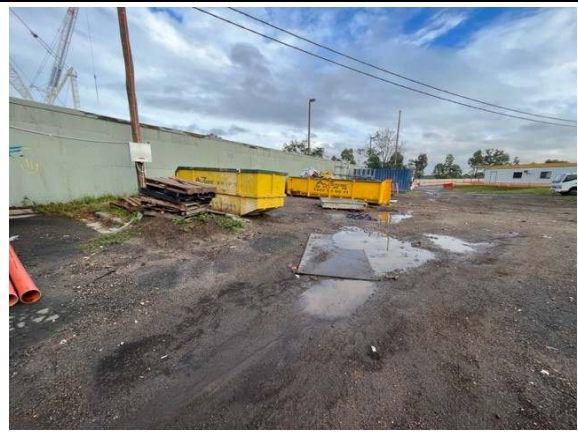
Photos 1 & 2: A stockpile was awaiting classification in the site compound. Waste storage areas were neat and no windblown litter was observed